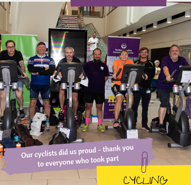
Our cyclists did us proud - thank you to everyone who took part