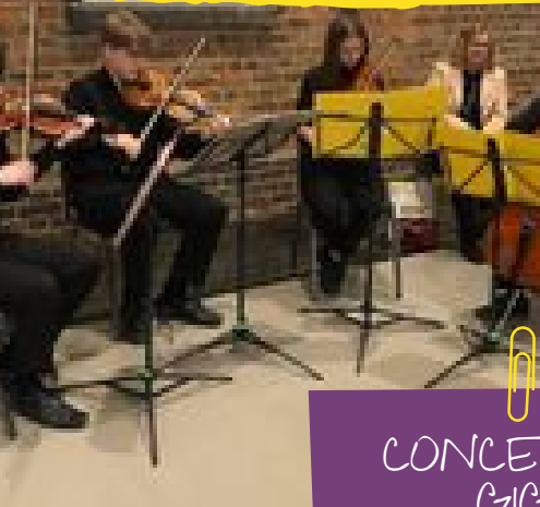
CONCERTS & GIGS

Here are some of the things our amazing supporter's have done to raise money for us in the past