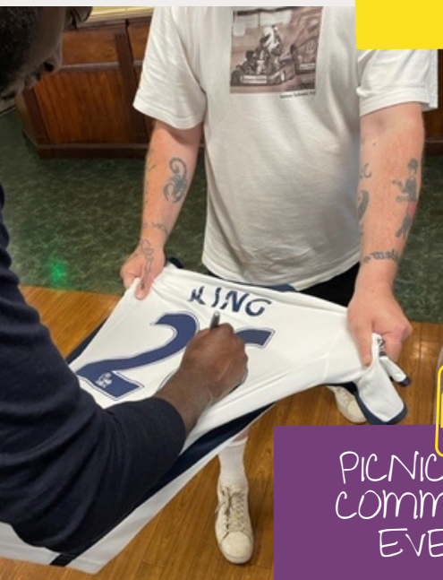
PICNICS AND COMMUNITY EVENTS