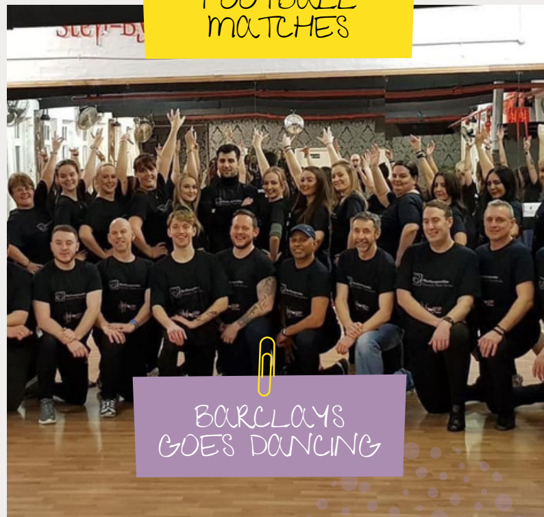
BARCLAYS GOES DANCING